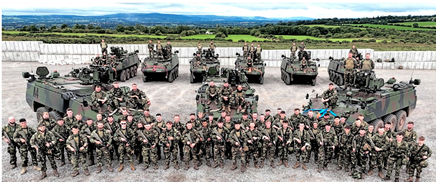
EUBG Inf Coy

January 2024 saw the commencement of the German led European Union Battle Group (EUBG). The Defence Forces are currently providing a Mechanised Infantry Company as Force Protection for the EUBG. The Battle Group is a two year commitment, divided into two distinct phases; 'STAND UP' Phase which is one year in duration involved the unit training in Ireland, a validation exercise in September and the completion of a EUBG Certification Exercise (MILEX 24) in Bergen, Germany in Nov/Dec 2024. The second phase is the 'STAND BY' phase and will last for one year, and commenced in January 2025. For the first six months, the Battle Group will be on 25 Days' Notice to Move (NTM), moving to ten days NTM for the last six months. An 'Alert Deploy' Exercise (MILEX 25) is scheduled for April/May 25 in Hungary.