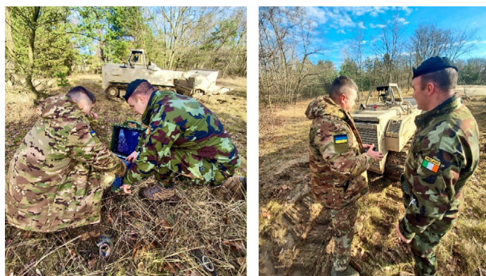
Mine Flail Training - EUMAM-UA

There were also several significant donations made from the Defence Forces to the Ukrainian Armed Forces; in early February, two Doking Mine Flails were donated after a small team of Engineers delivered an instructional course on the equipment. June saw a large donation of vehicles including Ford Rangers, Ambulances and DROPs trucks to the UAF through the International Donor Coordination Centre in Poland. Future donations are expected in 2025.