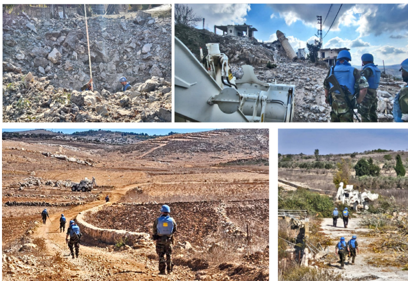
Operational Activities in UNIFIL

The Defence Forces continues to have the longest unbroken record of overseas service with the United Nations than any country in the world, since first deploying to a United Nations' mission in 1958. In 2024, Defence Forces personnel were deployed on United Nations, NATO PfP (Partnership for Peace), EU CSDP (Common Security and Defence Policy) and OSCE Peace Support and Crisis Management Operations across 12 missions in 13 countries. There are approx. 450 Defence Forces personnel currently serving overseas.