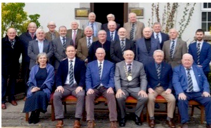
Pictured are those who attended the Association AGM.