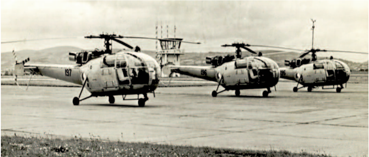
Pictured above are the first 3 Alouette III helicopters that served in the Air Corps. The numbers were 195, 196 and 197.

(c) that the Minister for Defence should submit draft regulations to govern the use of the helicopters for non-military purposes."